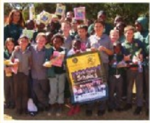
Gift of the Givers stationary distribution to schools.