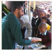
Gift of the Givers stationary distribution to schools.

How serious are we as a society in imparting values of Ubuntu and Humanity to our children and those around us, both in word and example. Gift of the Givers Japan Earthquake/Tsunami campaign addresses this very issue by encouraging South African students at all levels, Primary, Secondary and Tertiary, to participate in a campaign that will serve our own value system more than it will serve Japan.