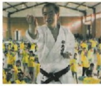
The Grandmaster in action.